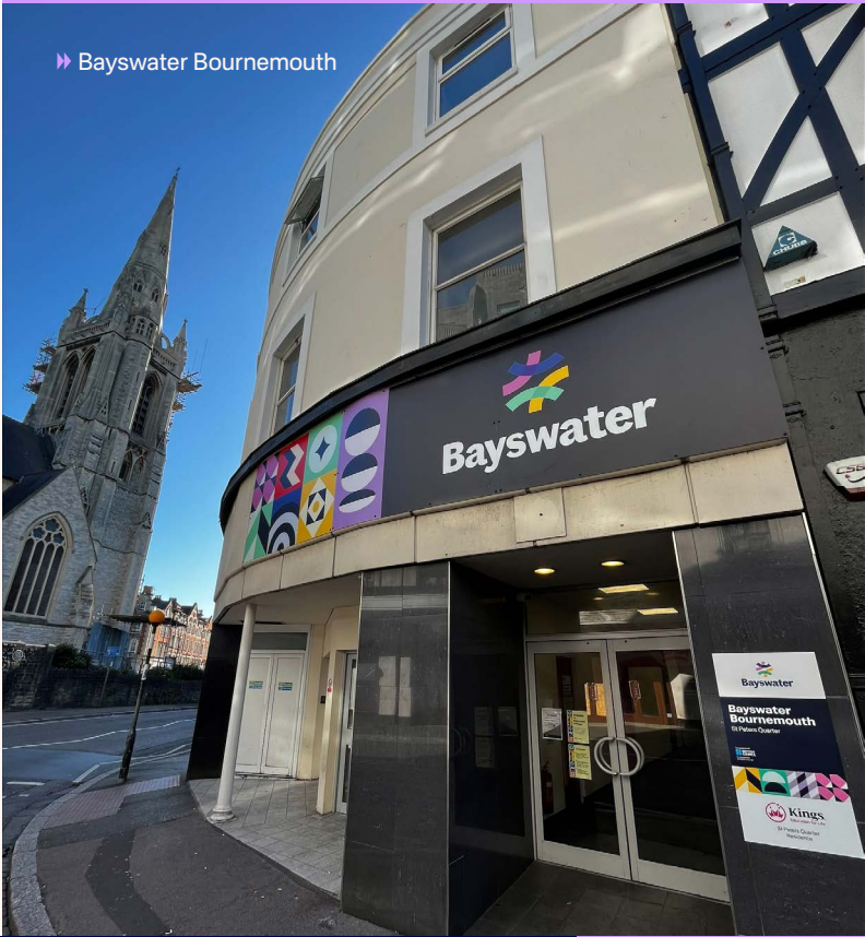
» Bayswater Bournemouth